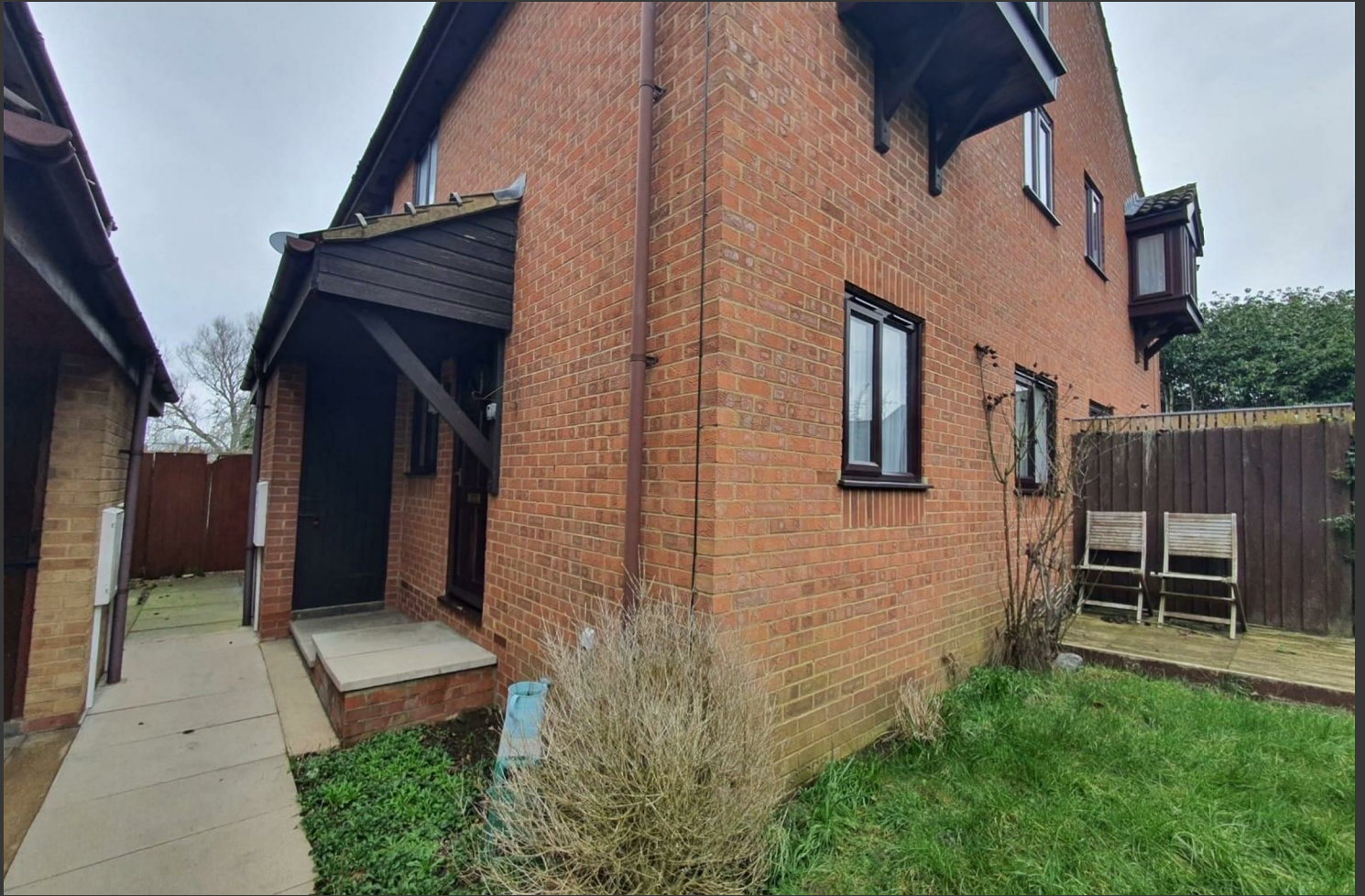
Aspen Close, Rushden NN10 9BX